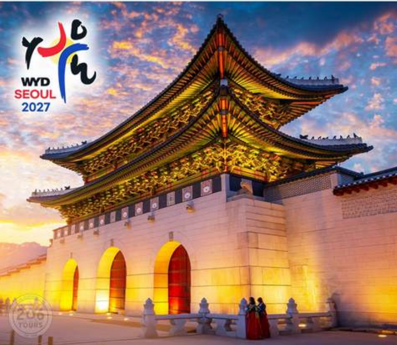
World Youth Day (WYD) 2027 - Seoul, South Korea