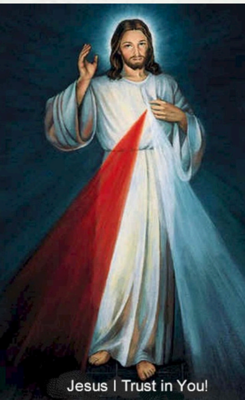
Jesus | Trust in You!